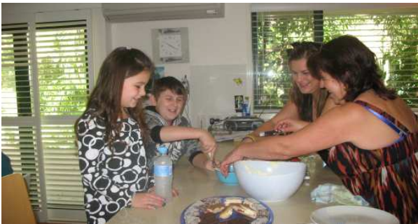
The Holiday House "in action"