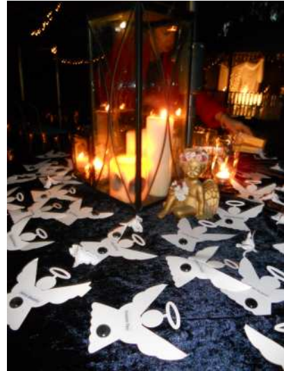
Memorial Service in honour of past residents of Hopewell Hospice