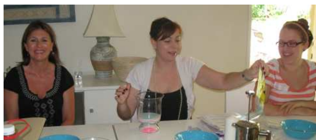
Holiday House Buddies