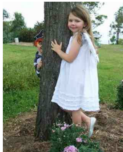
Children can be 'angels' or 'pirates' and Paradise Kids helps them own both energies.

We are also quick to respond to the crises that have rocked Australia this year and are taking a team of our counsellors to the Lockyer Valley in the June school holidays. We will provide group support for the children of flood victims and emotional help for parents, who are now realising that their losses are more than physical. At the same time we are offering a Suicide Intervention Program for that community.