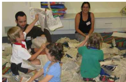
Paradise Kids Support Group. Children learn to use strong energy in safe ways.

REEDER MANAGEMENT MODELS • ACTORS • EXTRAS