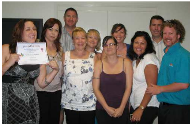
Child-Parent Relationship Training

Cost is $15.00 per session which includes coffee and cake for parents and morning tea for children. We are now taking enrolments for Term 3. Please phone (07) 5574 6853 for more details.