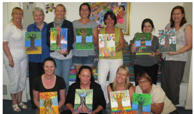
Tree of Life Group display their Art

Please call (07) 5574 6853 to register your interest. Limited places available.