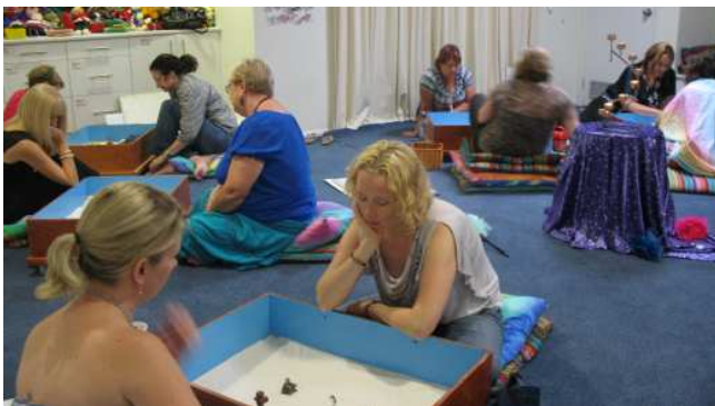
Participants in the Sandplay Therapy Experience

Future workshops will be held on 9 October for Day 1 and 20 November for Day 2. They are stand alone workshops, however Day 1 must be completed in order to register for Day 2.