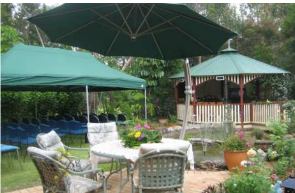
Hopewell Hospice garden chapel