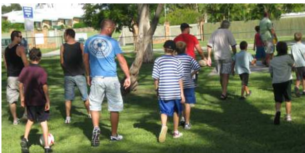
Men and Boys interact together